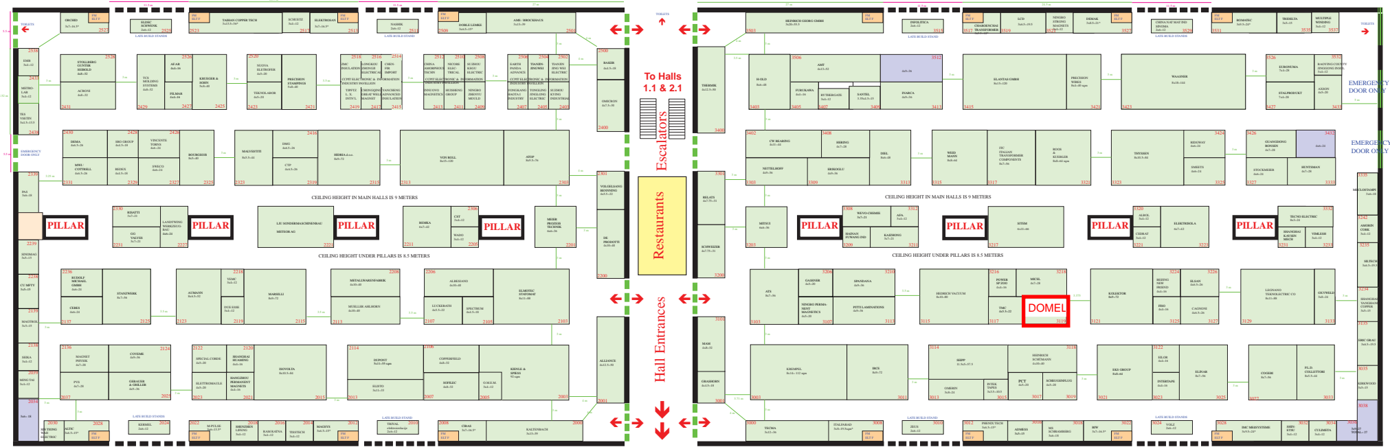
Hall 1.2 (Upper Level)

To South Hall Registration Area & Building Entrance